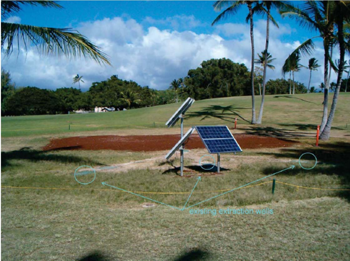
Figure 2. Pilot-Scale Bioreactor Solar Panel at Site LF05 JBPHH, HI